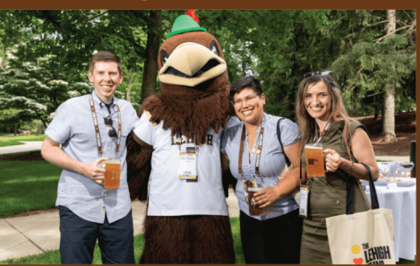
Relive your fun days on "The Hill" with classmates! Enjoy live music, beer, wine, food, and plenty of Brown and White!