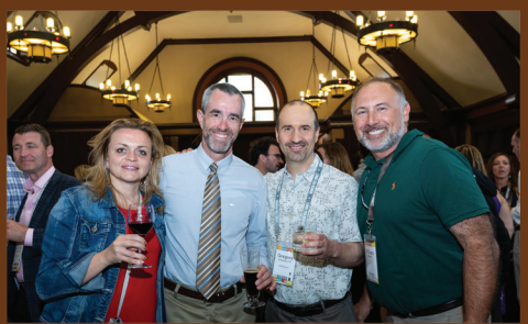
Wrap up Reunion weekend with your classmates as you relive and reconnect over all the memories you shared at Lehigh.