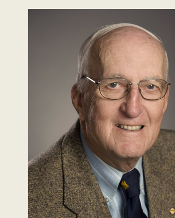
John E. Breen Professor & Nasser I. Al-Rashid Chair in Civil Engineering The University of Texas Austin, TX

The ABCD's of Bridge Building: Affordable, Beautiful, Constructible, Durable