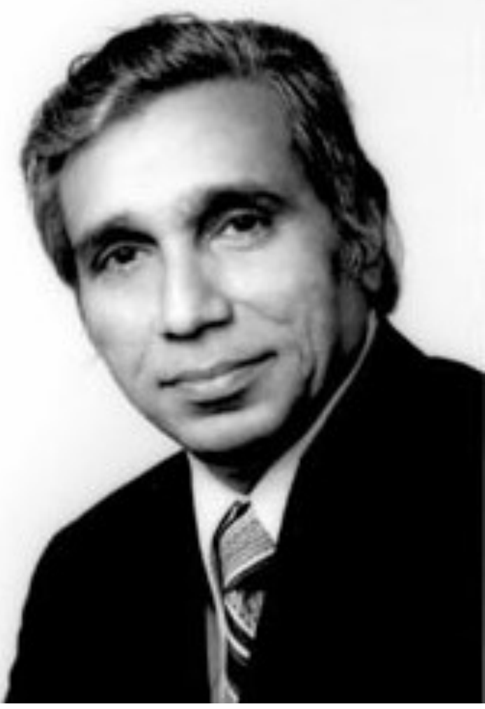
Fazlur Rahman Khan 1929 - 1982

Fazlur Rahman Khan ushered in a renaissance in skyscraper construction during the second half of the 20th century. Khan was a pragmatic visionary: the series of progressive ideas that he brought forth for efficient high-rise construction in the 1960s and 1970s were validated in his own work, notably his efficient designs for Chicago's 100-story John Hancock Center and 110-story Sears Tower (the tallest building in the United States since its completion in 1974).