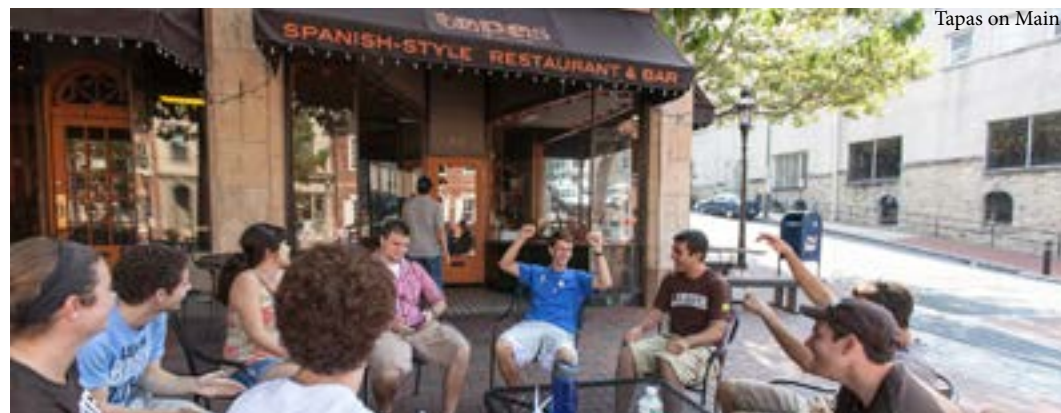
Tapas on Main