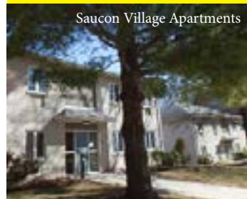
Saucon Village Apartments

Please visit www.lehigh.edu/housing/offcampus for additional off-campus housing information.