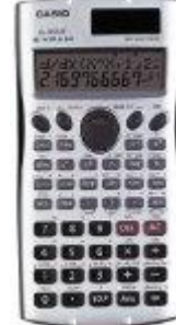
Casio FX 115MS