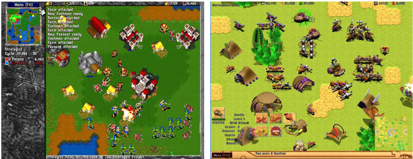
Figure 1: Screenshots of two Stratagus games. The left shows Wargus, a clone of Blizzard’s Warcraft II™ game, and the right shows Magnant. The Wargus game is situated in a fantasy world where players either control armies of humans or ‘orcs’. Magnant combines an RTS game with a trading card game. In Magnant, players can collect, exchange, and trade cards that give them unique abilities.

abstraction of the state and decision space (e.g., Madeira et al. , 2004; Ponsen et al. , 2005; Aha et al. , 2005).