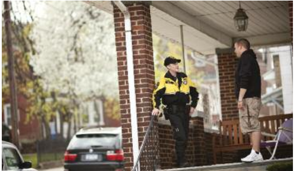
The successful Community Policing initiative the LUPD has undertaken with the City of Bethlehem's Police Department expands patrols in off-campus neighborhoods, and helps to forge productive relationships between students and year-round residents.