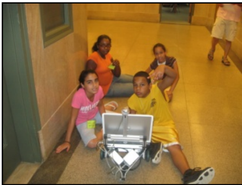
Testing a Robot (8 th & 9 th grade students)