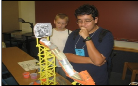
Building a Roller Coaster (6 th & 7 th grade students)

“Hands-on activities during the Summer Sessions”