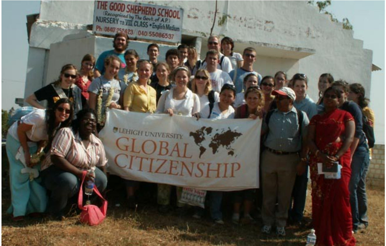
A group photo from Cohort IV's Intersession Trip to India.