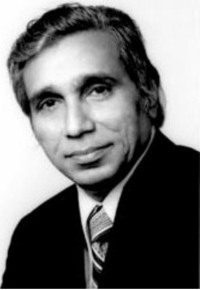
Fazlur Rahman Khan