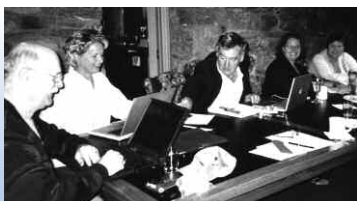
FACULTY WORKING SESSION ON MERGER.

Merging the two programs into one offers additional opportunities to strengthen the Learning, Sciences and Technology doctoral program, to respond in a timely manner to changes in PDE, and to enhance current collaborations with the International program and the Special Education program. The faculty of the new TLT program have many and varied partnerships within the Lehigh University community that will have further opportunities for development.