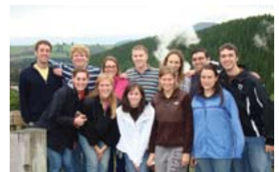
New Zealand 2008