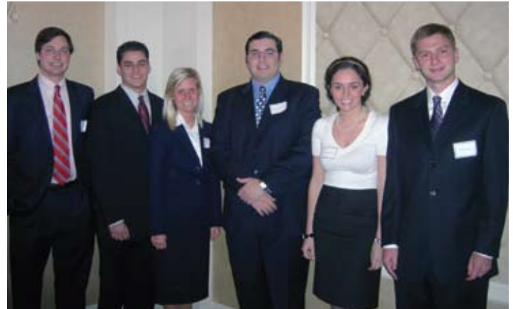
Incoming Officers 2008-2009