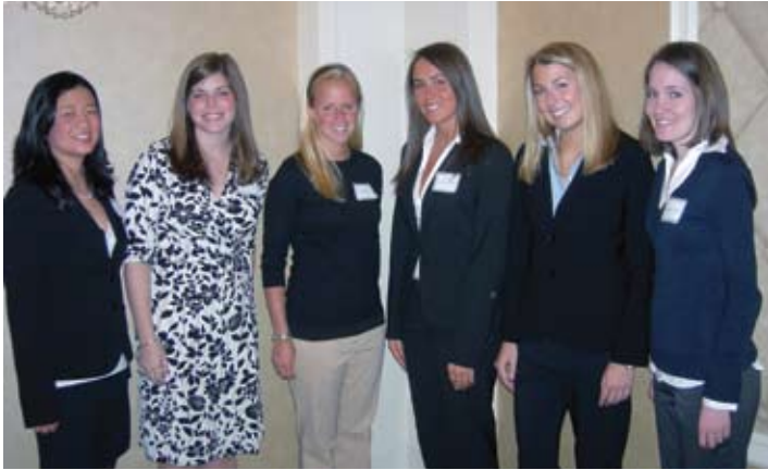
Outgoing Officers 2007-2008