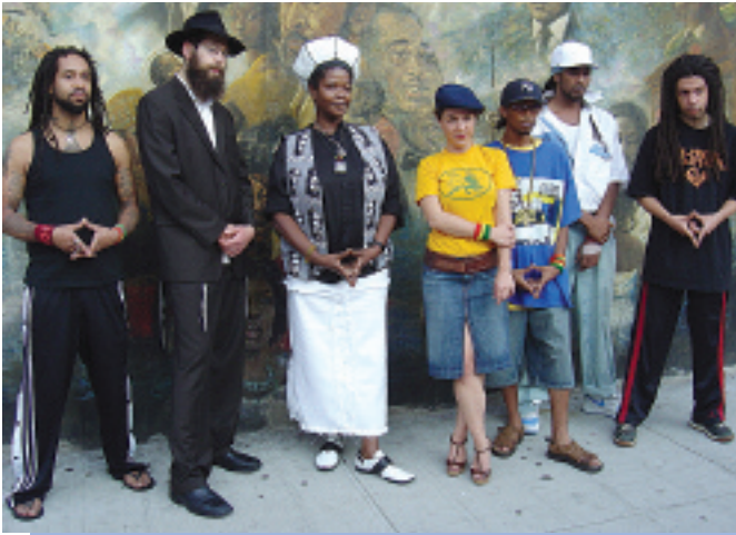
Reggae artists from Awake Zion