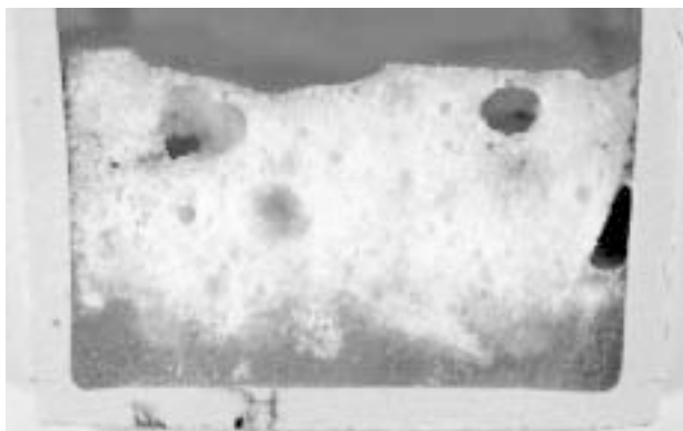
Fig 1: Cross section through crucible Nr 3, fired about 20 degrees below liquidus temperature. Note the formation of some glass only, indicating incomplete or partial melting.

Different batch compositions covering the range of 'Egyptian' and 'Roman' glasses were melted in crucibles at temperatures from 900°C to 1200°C at intervals of 50°C for 16 hours. Mullite crucibles were used to reduce the interaction between the vessel and the formed glass. The cooled vessels were cut open to study the degree of separation of the glass phase and any residue, and the volume proportion of glass to crystalline phases (Fig. 1). Samples were initially investigated optically to inspect the level of crystallization. Microprobe analysis was then used to determine the composition and homogeneity of the formed glass, and to identify crystalline phases (Fig. 2). Measuring the alumina content of the resulting glass allowed to monitor any interaction between the glass and the mullite crucible.