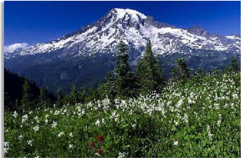
Mt. Rainier July, 1975