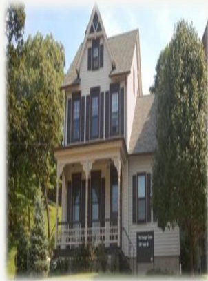
University Dialogue Center