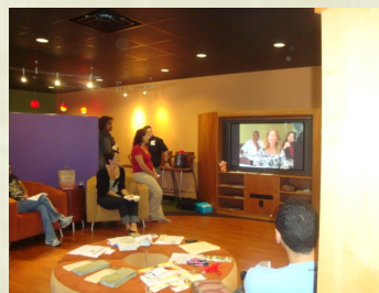
“Did you jus say what I think you said?” Addressing multicultural microaggressions in academia training