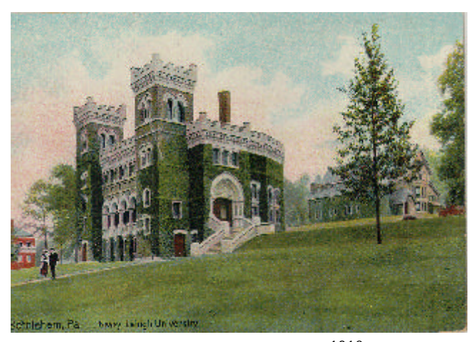
LINDERMAN LIBRARY, POSTCARD CA. 1910