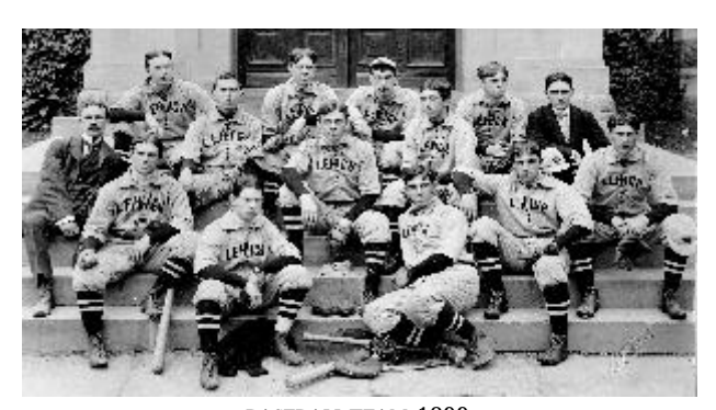
BASEBALL TEAM, 1899