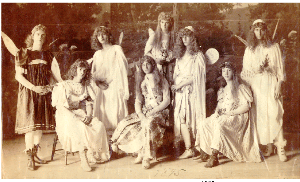
MUSTARD AND CHEESE DRAMA SOCIETY, 1895

That's why we decided a number of years ago to forego trying to organize the photographs themselves for access, and instead rely on a database manager to