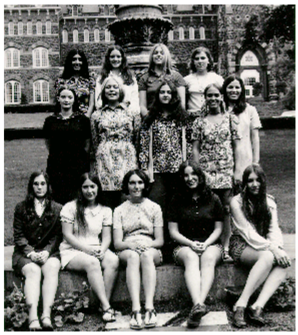
FIRST COEDS, 1971