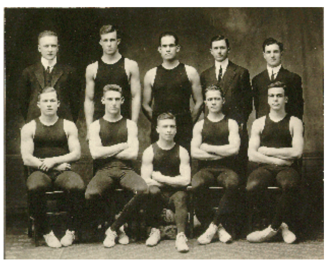
WRESTLING TEAM, 1913

One of the problems of making photographs accessible is that they often don't have just one subject. That photo of the 1899 Lehigh baseball team may include, for example, pictures of identified