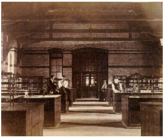
CHEMICAL LABORATORY, 1890