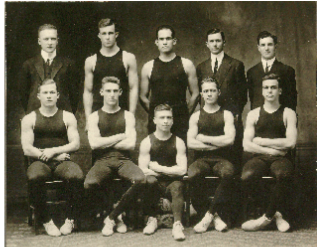
WRESTLING TEAM, 1913

hundreds of image files in easily transportable form. One of the problems of making photographs accessible is that they often don't have just one subject. That photo of the 1899 Lehigh baseball team may include, for example, pictures of identified