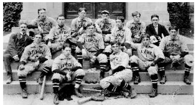
BASEBALL TEAM, 1899