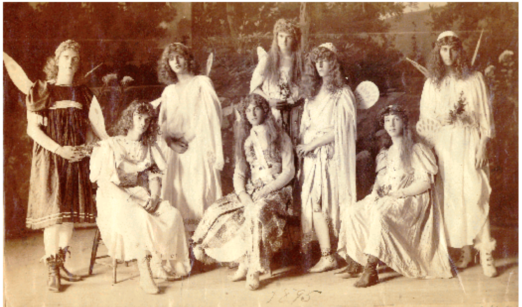
MUSTARD AND CHEESE DRAMA SOCIETY, 1895

That's why we decided a number of years ago to forego trying to organize the photographs themselves for access, and instead rely on a database manager to