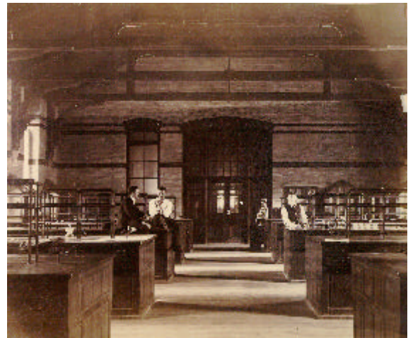
CHEMICAL LABORATORY, 1890