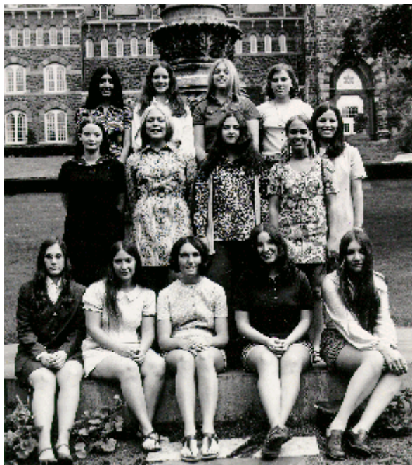
FIRST COEDS, 1971