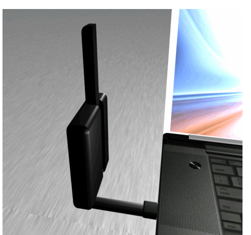
Figure 2. hField's USB wifi antenna.